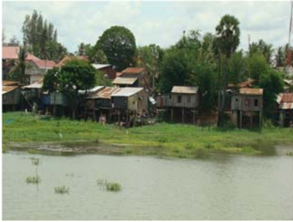
Community along the river