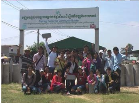
Real practice with Community builder at training center for community builder