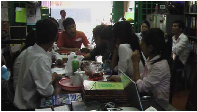
RUFA , Norton ,Cambodia Mekong University And YP from UPDF