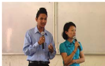
Comment and suggestion