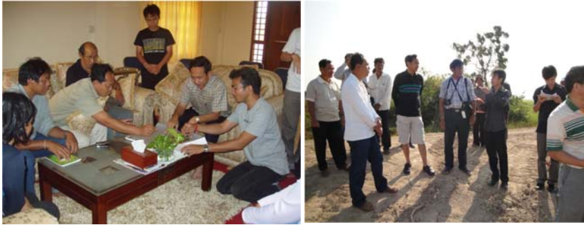
Meeting with government provincial