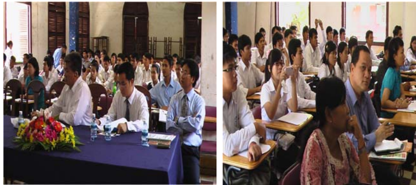
Presentation to university and student