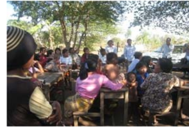
Meeting with community